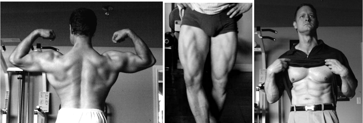
Photos 1-3 of Subject 1 at age 40 show the musculature achieved from brief, intense and heavy exercise, but which exercise did little to maintain or increase the strength of his lumbar muscles.